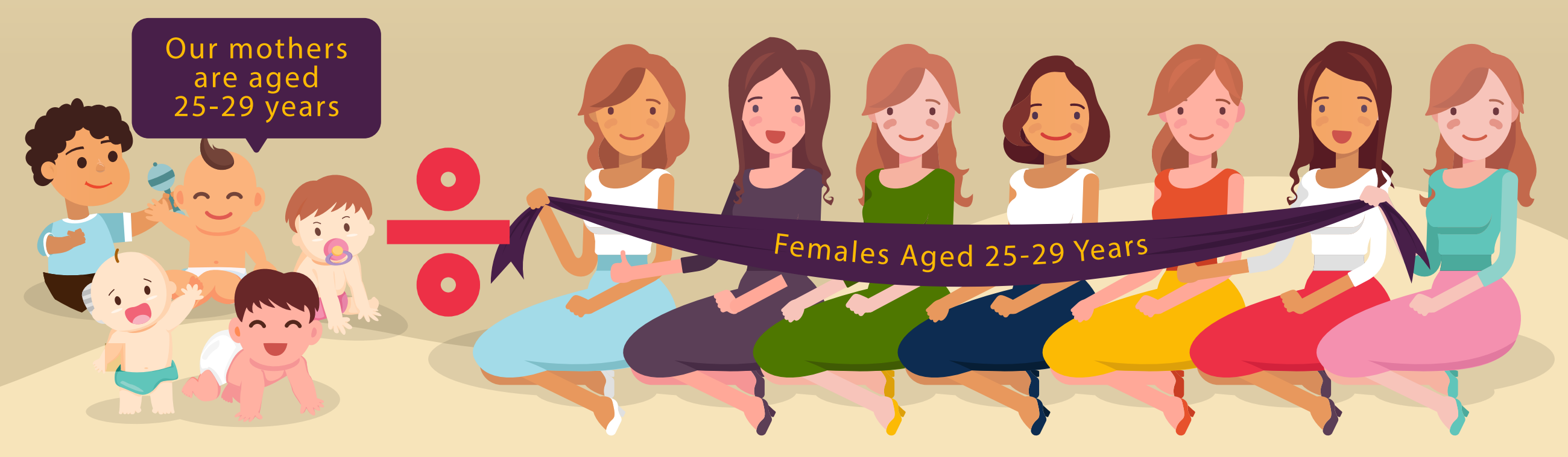
Illustration for computation of ASFR for 25-29 years

Age-specific fertility rate (ASFR) is the number of live-births born to females of a specific age group, out of every thousand females in the same age group.