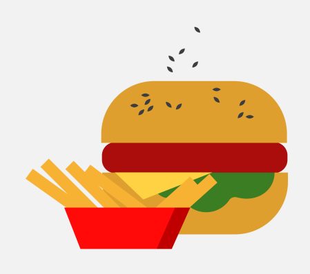
Singapore: $$5.90 USA: U$$5.65 PPP = 5.90/5.65 = 1.04$$ per U$$

Suppose the prevailing exchange rate is S$1.37 to US$1. A tourist from the US visiting Singapore exchanges US$5.65 (price of a Big Mac in the US) to S$7.74 at a bank upon arrival (based on the prevailing exchange rate). After buying a Big Mac in Singapore, he will have S$1.84 remaining.