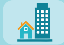
Type of Dwelling